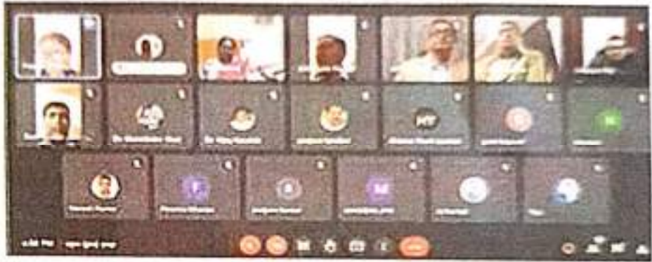
ऑनलाइन आयोजित सम्मेलन का दृश्य।